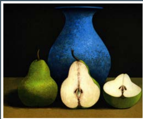
Pear and Two Halves Colour Etching by Terence Millington