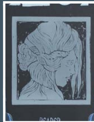
Eliza Malone Screen print, Woodcut & Letterpress by Andrew Kinnear

GPC artists turn to their local rural landscape for inspiration, whilst naturally NYC provides distinctly different subject matter."