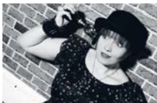
liberating and wonderful comedy improvisation course.