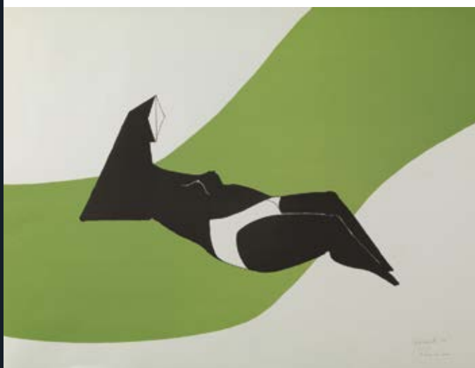
Reclining Figure (Green Wave) Lynn Chadwick

Next exhibition: Lynn Chadwick draughtman 26th September - 6th November