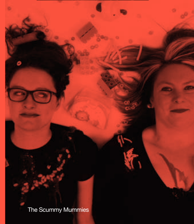
The Scummy Mummies