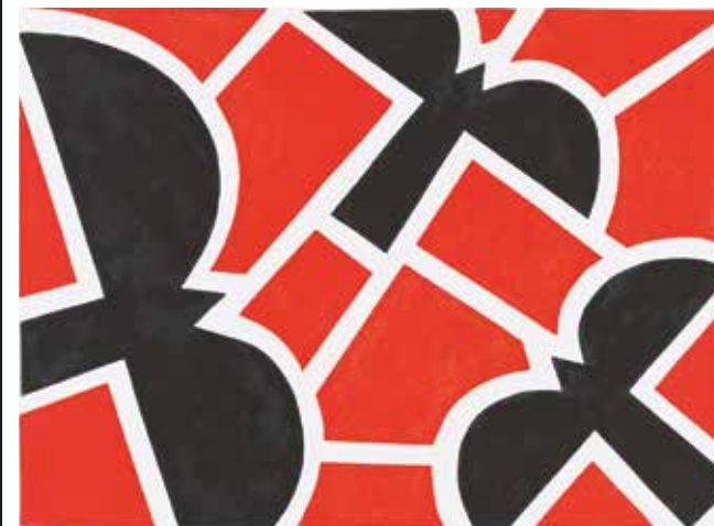
Black Wings, Red Fields Jon Buck