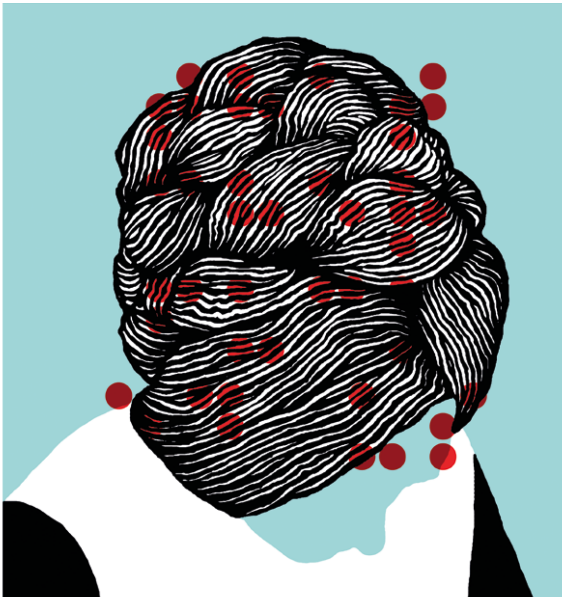
Thatcher Personal Collection