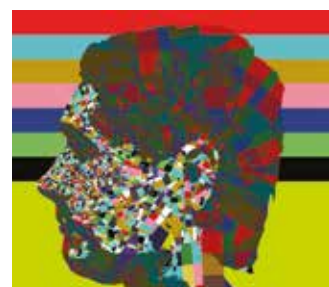
Neurotic Imposter The Guardian