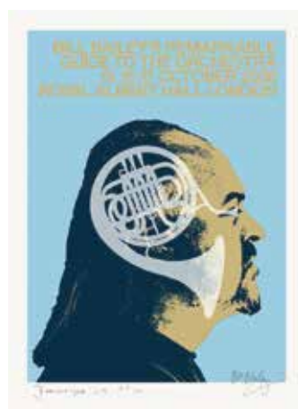
Bill Bailey Royal Albert Hall London