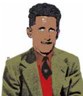
George Orwell TimeOut Magazine