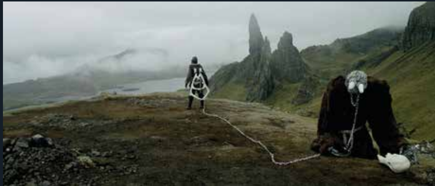
Sick To My Bones