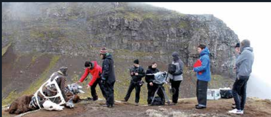
Filming 'Sick To My Bones', Isle of Skye (2014)