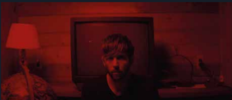
Owen Pallett 'In Conflict'