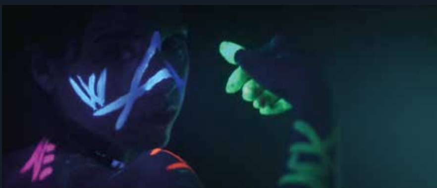
Hudson Mohawke 'Warriors'